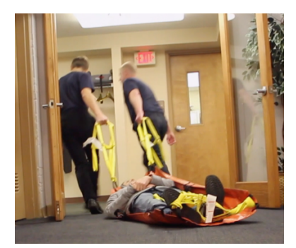
"Drag and Go" Configuration

1. The Nash Strap<sup>™</sup> is designed to be used as a set of four separate straps for the "carrying" configuration and as a set of two straps for use in a "drag" configuration.